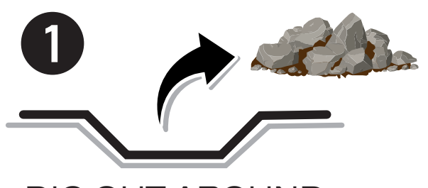
DIG OUT AROUND DAMAGED AREA