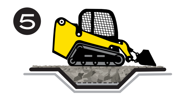
FINE GRADE ENTIRE ROAD COMPACT WITH ROLLER