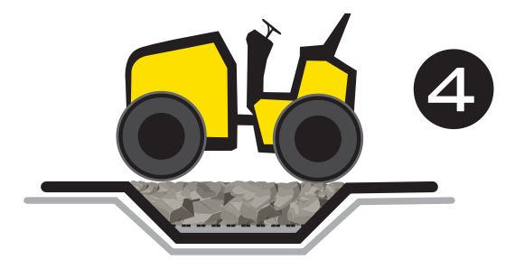
ADD ROAD BASE GRAVEL COMPACT WITH ROLLER